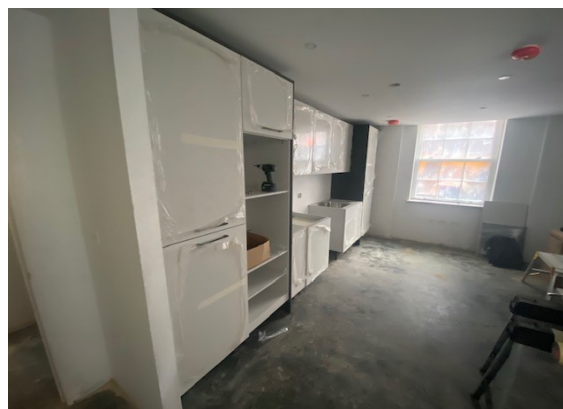
Fig 2: Preview of a new kitchen installation

We thought you may like to have a sneak preview of the inside of these new homes which will all be for sale.