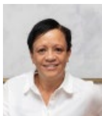
Managing Resident Liaison Officer

If you wish to discuss any aspects of our construction activities please use the contact details below.