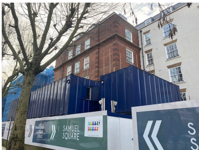
Fig 3: External works near our site offices

We shall be adding the top soil and turfing to previous phases in mid spring 2021 and will report more on that as we begin landscaping.