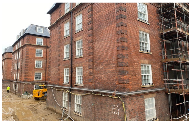
Fig 1: View of the final phase 5 at Lisgar Terrace

We would like to take this opportunity to notify you in advance to expect some noisy works whilst we use excavators to cut slabs. These works are due to commence 15 March 2021, we shall do all we can to keep the noise to a minimum by working intermittently and within our working hours 8 - 5pm.