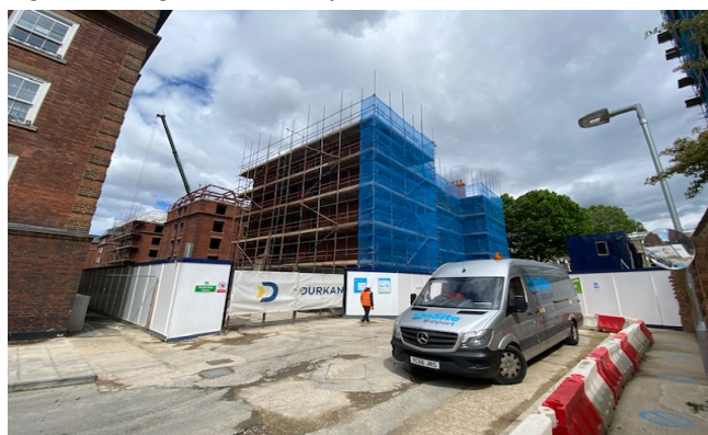
Fig 2: Showing the additional floors

Encompassed within the overall regeneration of Lisgar Terrace, is the refurbishment of the boundary brick wall which is in design and due to start later this summer.