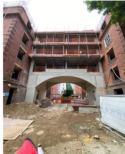
Fig 3: New arch constructed on the final phase at Lisgar Terrace

In agreement with Southern Housing Group and at the request of many residents, we are pleased to advise that all windows estate wide at Lisgar Terrace, will be cleaned externally. As soon as we have confirmed dates for each building you will be notified.in writing.