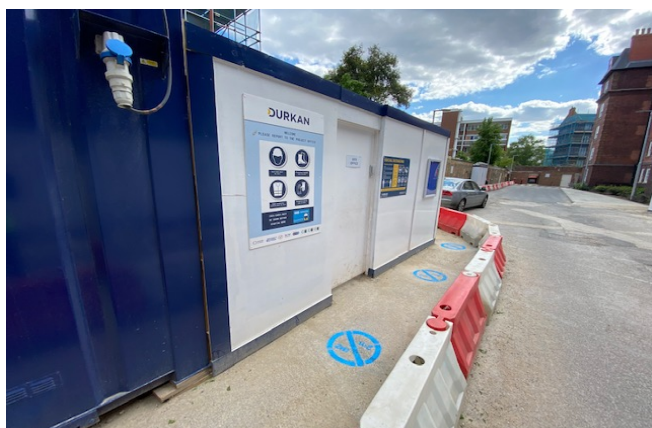
Fig 1: An example of a social distancing measure on site

On occasion tasks on site require 2 operatives to work together which is allowed under the guidelines, but only on the basis that the workmen are side by side, work with caution and do so for a period of less than 15 minutes.